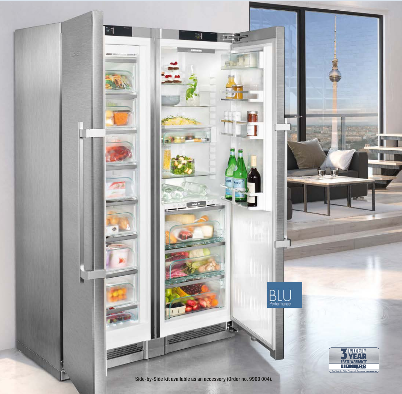
Side-by-Side kit available as an accessory (Order no. 9900 004).