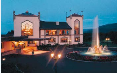
Hotel Dunloe Castle