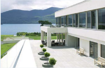
The Europe Hotel & Resort

Liebherr's Killarney Hotels Ltd. owns and operates two five-star luxury hotels in Killarney, including The Europe Hotel & Resort, situated on the famous Lakes of Killarney and Hotel Dunloe Castle overlooking the Gap of Dunloe. The company also owns and manages Ard na Sidhe Country House, a delightful Victorian style manor house, which is situated on the shores of Caragh Lake just outside Killorglin.