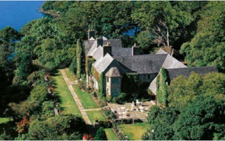
Ard na Sidhe Country House

To order spare parts or accessories please call 01 4600064 or email liebherr@naa.ie with the model and 9 digit service number. The parts or accessories can be quickly despatched direct to your home.