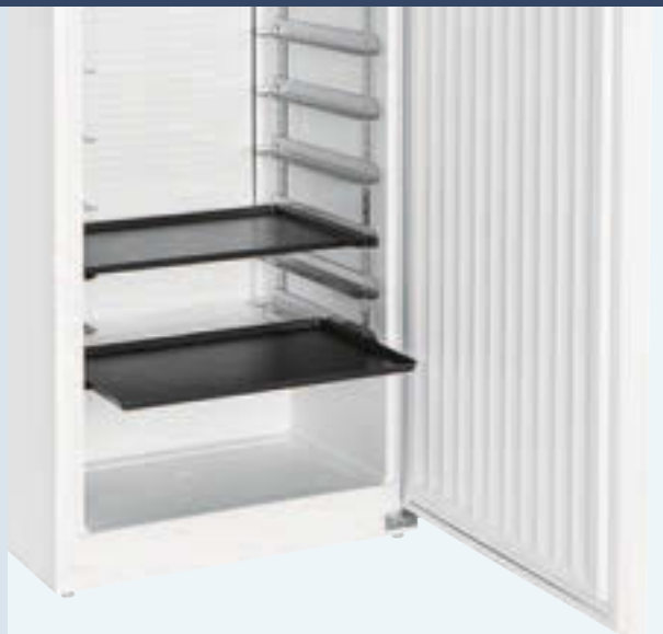
Easy use – shelf removal at 90° door opening.

The appliances are designed for ambient temperatures from +16°C to +43°C, so they are suited for use in a hot bakery or in branch stores with frequent door openings. The refrigeration system is well-balanced designed to meet demanding practical requirements.